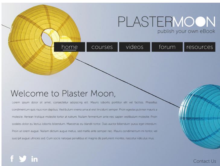
Custom Portal Design

Once partnered, TTS will begin the design process, in association with you and your team, to achieve the optimal blend of online elements as well as create the most engaging look and feel for your brand. Elements may include, but are not limited to: